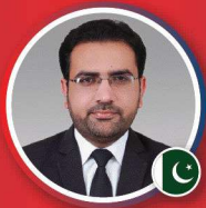
WASEEM YOUSAF - PAK